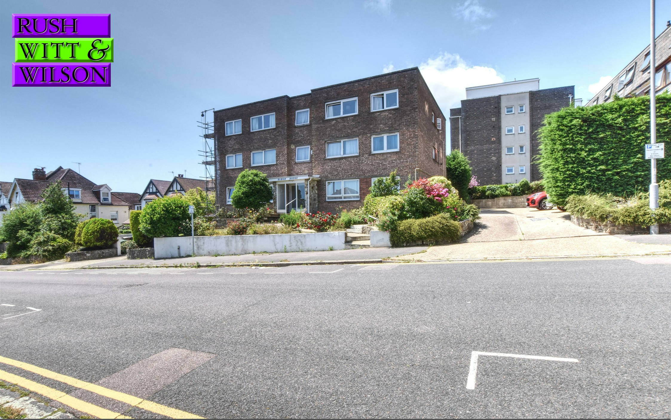
6 Saxon House Manor Road, Bexhill-On-Sea, East Sussex TN40 1SU £200,000